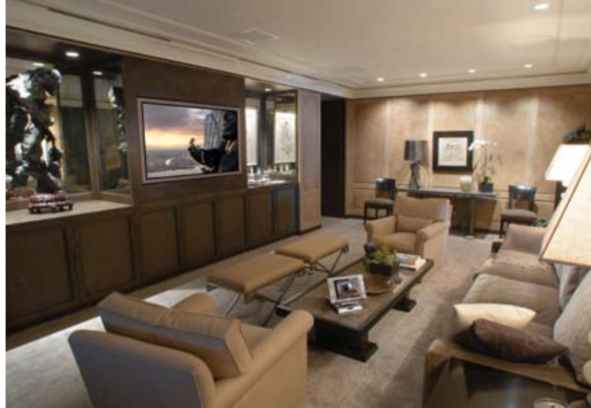
Maximum Home Theater: The Duchossois family enjoys having hundreds of movies and music titles available at their fingertips in their relaxing home theater.

"Coming in, one button. Going out, one button. Security, one button. Sound system...you've got lots of buttons, but it's easy to pick one right from the chute. Really, it's an ease of living issue."