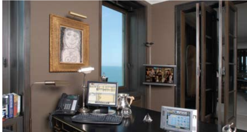
The Virtual Office: AMX Web and Computer Control applications enable easy access of a PC from an AMX Touch Panel, or access to the AMX system from anywhere over the Internet.