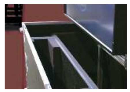
Storage area for second monitor.