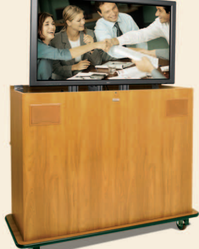
Monitor not included