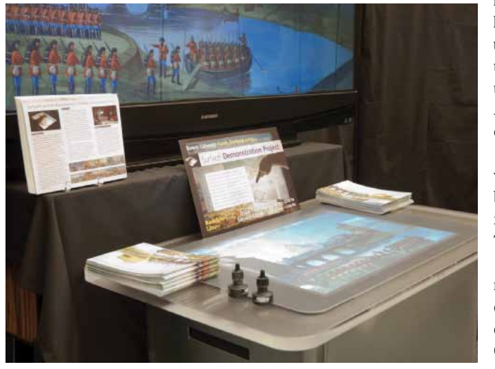
The original Microsoft Surface demonstration unit, with its 30in. touchscreen and a section of the Garibaldi panorama on display. The finished system uses two 50in. Panasonic displays with DualTouch overlays and Windows 8 for touch support.