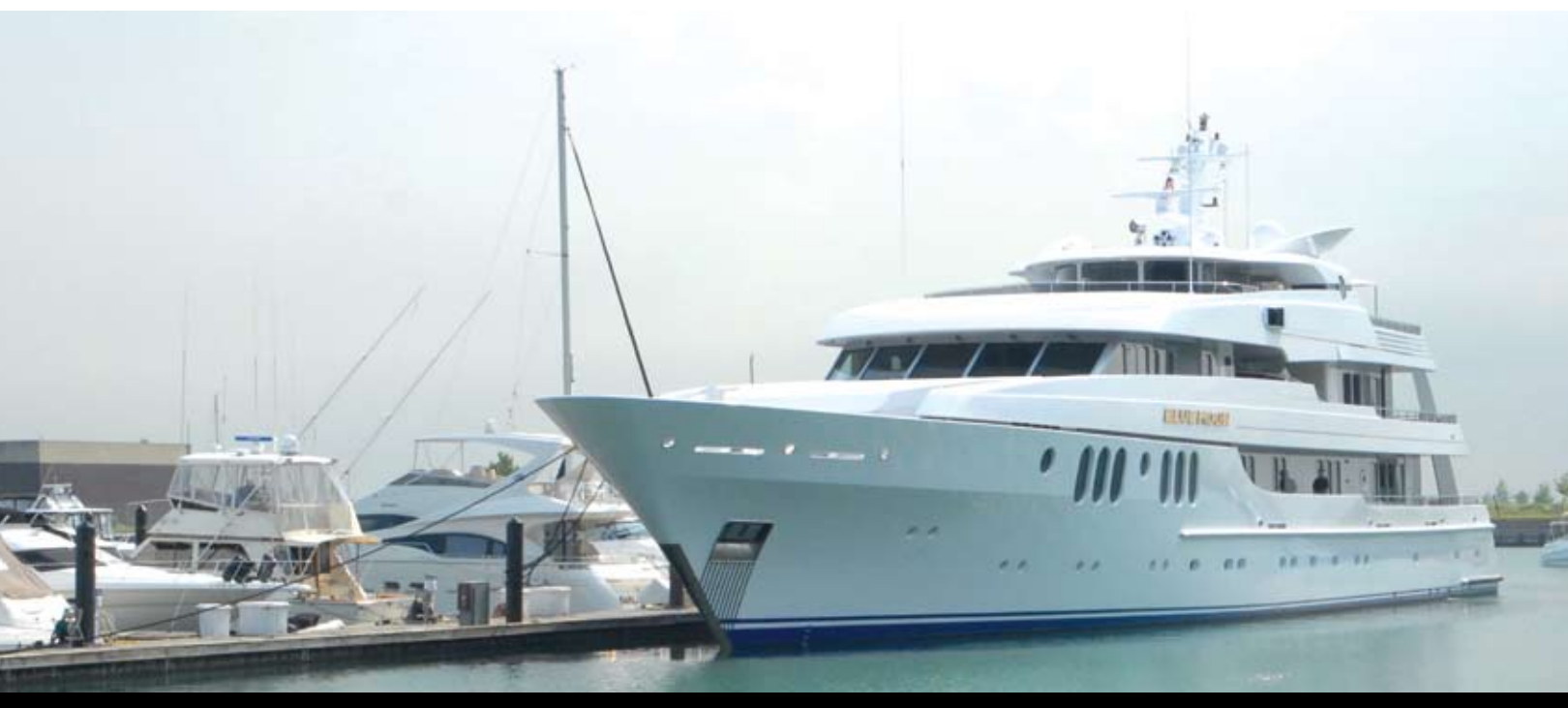
Bon Voyage The Blue Moon is docked and ready for its next adventure

"We use the AMX system to distribute and control all the audio visual functions on board – from a centralized rack area in the bridge, to every cabin or room on the boat."