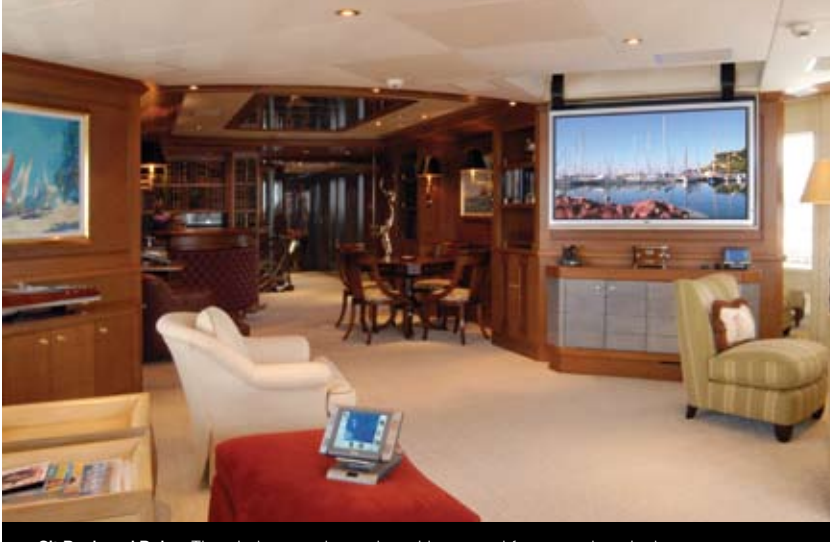
Sit Back and Relax The wireless touch panel provides control from anywhere in the room

The Blue Moon is an impressive piece of art and engineering – good enough to win a Monaco Showboat International "Best Yacht" award last year, and good enough to handle a Duchossois granddaughter's recent wedding reception. For this family-centered businessman, that was perhaps the more impressive achievement.