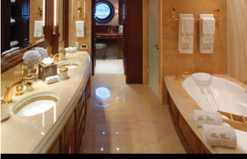
Elegance Redefined No detail is overlooked in the luxurious master bath